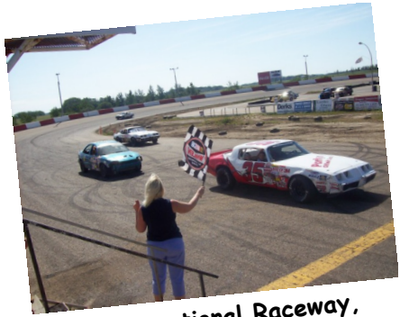
International Raceway, ride in a race car!

Please note that payment must be made in advance. Payment can be made in the form of post dated cheques from the time of application, MasterCard, Visa and or cash