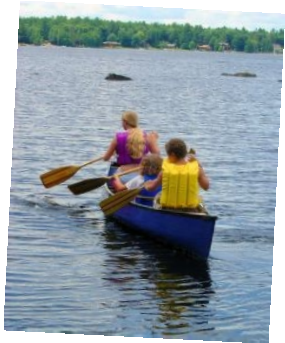
Canoeing is challenging and Fun!

Summer Camp will provide a safe, caring and positive learning environment all while your child is having a BLAST!